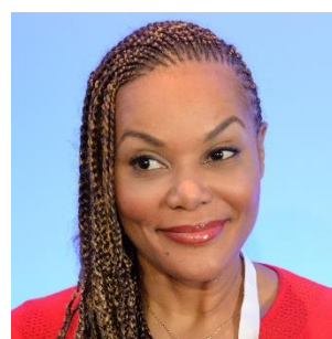
Mrs. Malika Bongo Ondimba President Défis de Femme Gabon