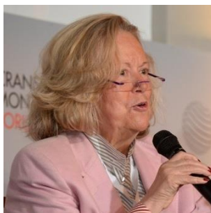
Mrs. Anne-Marie Lizin Honorary Speaker of the Senate Belgium