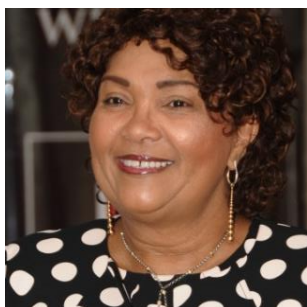
Mrs. Chantal Compaoré First Lady Burkina Faso