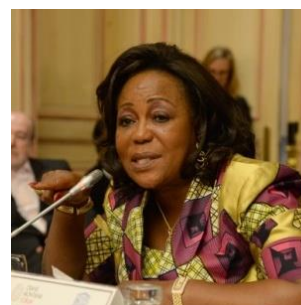
Mrs. Antoinette Sassou-Nguesso First Lady Congo