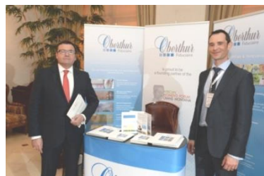
Oberthur Fiduciaire Founding Partner of the African Women's Forum