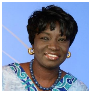
Mrs. Aminata Touré Prime Minister (2013-2014) Senegal