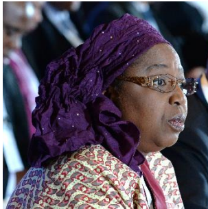
Mrs. Awa Marie Coll Seck Minister of Health & Social Welfare Senegal