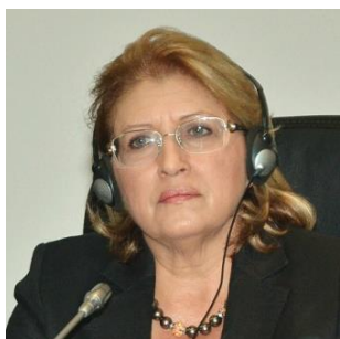
Mrs. Marie Louise Coleiro-Preca President of the Republic Malta