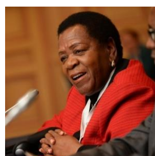
Mrs. Edna Madzongwe President of the Senate Zimbabwe