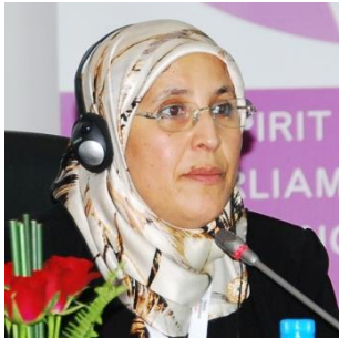
Mrs. Bassima Hakkaoui Minister Solidarity, Women, Family Morocco