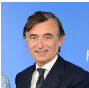
Mr. Philippe Douste-Blazy Under Secretary General United Nations