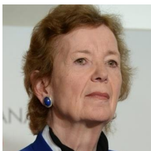
Mrs. Mary Robinson Special Envoy of the UN Secretary-General President of Ireland (1990 – 1997)