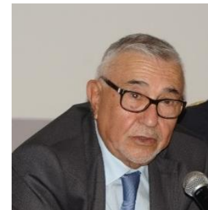
Mr. Abdelwahad Radi President Inter-Parliamentary Union