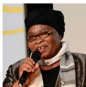
Mrs. Sizakele Khumalo Zuma First Lady South Africa