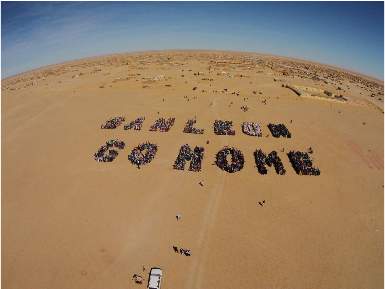
Photo: Thousands of Saharawi refugees stated their position on San Leon's search for oil in their occupied homeland. 11 October 2015.

San Leon Energy plc operates under an oil license in Western Sahara by an agreement with the territory's occupier; the Moroccan government. In violation of international law, the company has proceeded to undertake the first ever onshore drilling operation in the history of Western Sahara under Moroccan occupation. An oil find in Western Sahara would cause irreparable damage to the UN led peace process and greatly diminish the chance of a peaceful solution to Africa's longest running conflict. This briefing documents San Leon Energy's past and present in Africa's last colony. A background note on the Western Sahara conflict is included on the final page of the briefing.