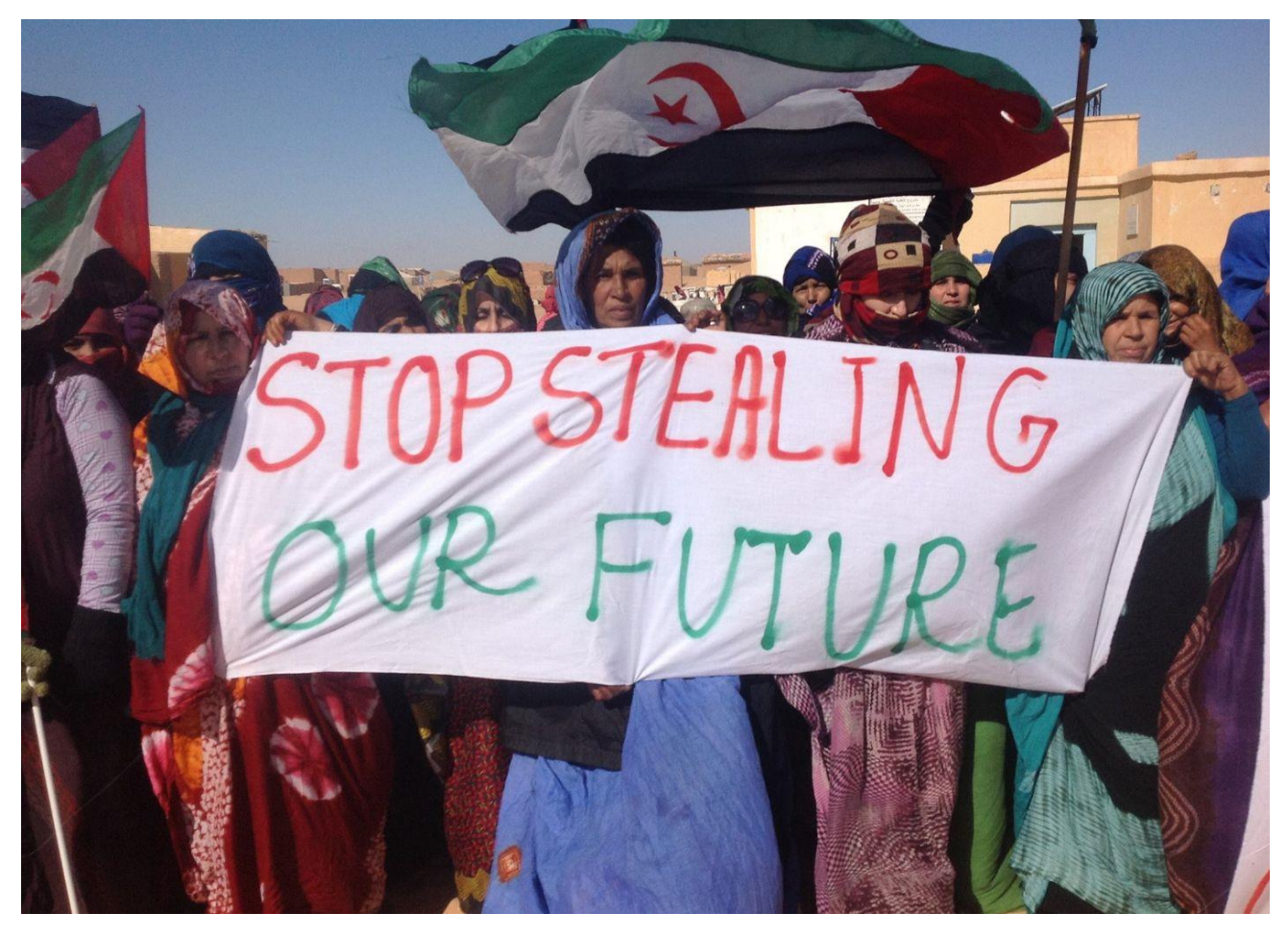
Photo: Saharawi refugees exiled Algeria protest against oil companies, like Total, that are looking for oil in their occupied homeland. March 2015.

Total S.A. operates under an oil licence in Western Sahara by an agreement with the territory's occupier; the Moroccan government. In violation of international law, the company has been looking for oil in Western Sahara's territorial waters. An oil find in in the territory would cause irreparable damage to the UN led peace process and greatly diminish the chance of a peaceful solution to Africa's longest running conflict. This briefing documents Total's past and present in Africa's last colony. A background note on the Western Sahara conflict is included on the final page of the briefing.